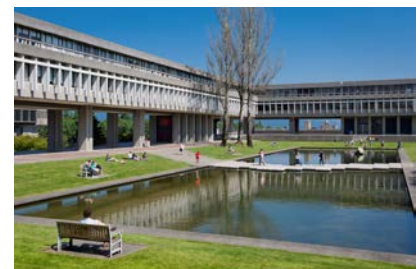
Simon Fraser University

For further details see: http://www.sfu.ca/vpacademic/Faculty_Openings/Collection_Notice.html .