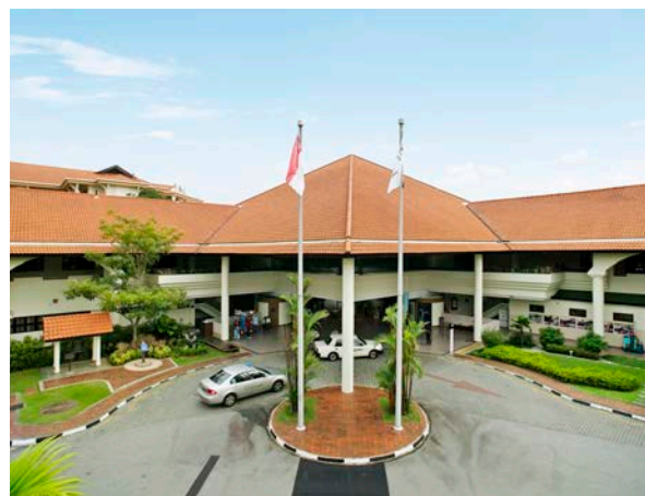
Institute of Mental Health

Forensic Psychiatry Community Services (FPCS) is an aftercare programme that assesses OMDs prior to their release from prison and follows up with them up to a year after their release. The programme was initiated to address the poor attendances of OMDs at the clinics upon their release from prison. The team consists of a forensic psychiatrist, medical social workers, case managers and administrators from IMH. The aim of the programme is to monitor OMDs' appointments at IMH and work with the OMDs on reintegrating into the community. As FPCS is a voluntary programme, the OMDs may reject the service and thus it would be a challenge to engage them in treatment. Nevertheless, having a consistent caseworker to turn to for assistance in practical matters such as finances and accommodation was seen to be helpful in the reintegration process of OMDs.